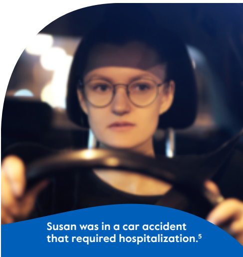
Susan was in a car accident that required hospitalization. 5