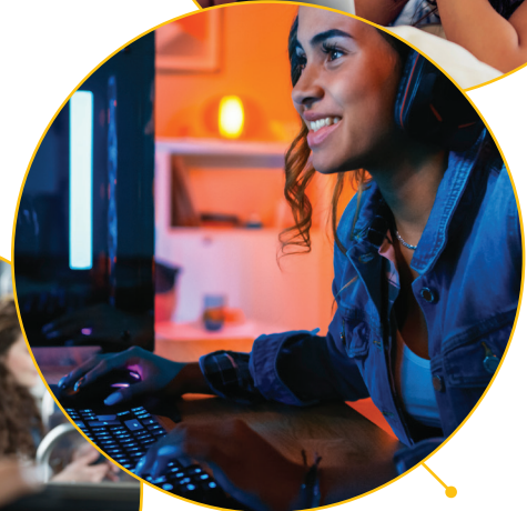
IDENTITY THEFT PROTECTION