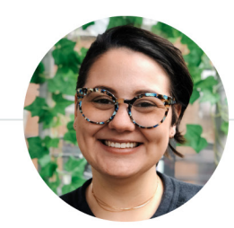
Skye Your Maven Care Advocate Your personal healthcare concierge

We're here to support you for anything you need. On Maven, you'll get healthcare the way it should be.